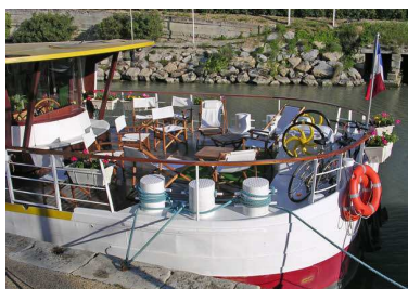
LE PHENICIEN , Deluxe barge, 18 passengers, Sunday to Saturday, 6 nights

LE PHENICIEN is not your usual barge. It is amazingly luminous with its huge picture windows and immediately reflects all the colors and light that is Provence. Decorated by its French owners in a contemporary Provencal style, its warm colors invite you in and make you feel immediately comfortable. The fabulous food and fine wines are accompanied by a diverse and fun itinerary to Provence's most favorite sites.